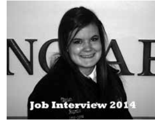
Job Interview: Elizabeth Warren